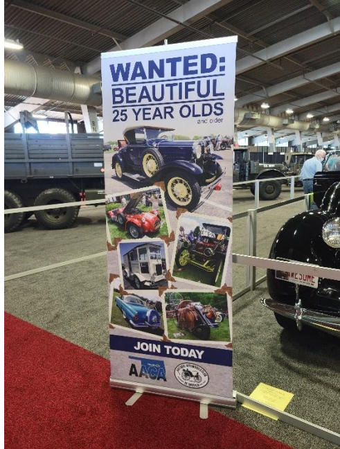
Tulsa AACA advertisement