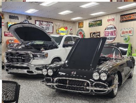
Corvette and Ram Truck