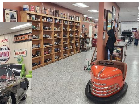
Bumper Car and display shelves.