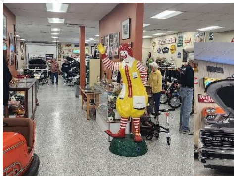
Ronald McDonald Display