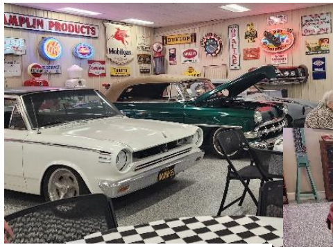
Cars on display with Bruce Rick's collection.