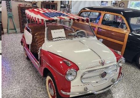
1960 Fiat Jolly