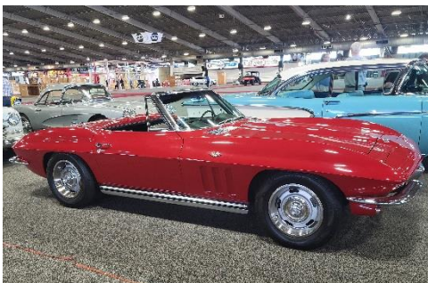
1965 Corvette – Elbert Polk