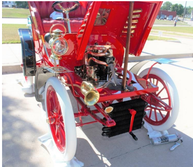
Notice how low the radiator is mounted!

I photographed this automobile at Mason City, Iowa in 2013. How would you like to polish all that brass and copper!