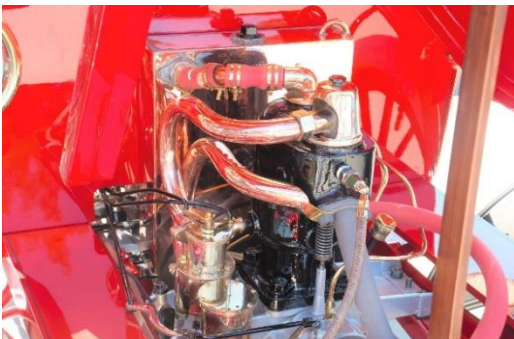
The Holley one-cylinder engine

The car has a 5hp water cooled single cylinder engine mounted in the front under a French styled hood.