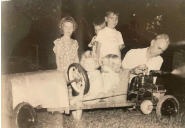
All my cousins & my dad making smoke

Power was always transmitted from the engine to a jackshaft and from the jackshaft to both rear wheels with pulleys and v-belts. The belt from the engine to the jackshaft utilized a tensioner pulley connected to a foot pedal that became the de facto clutch.