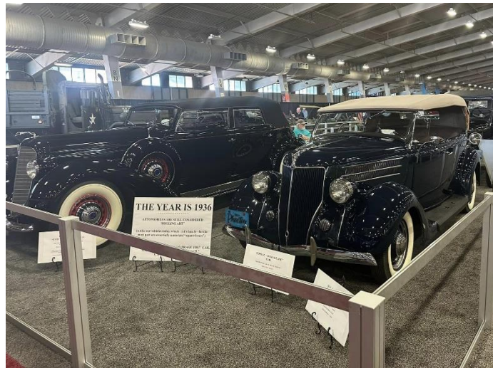
Display by Steve Schnitzer contrasting a 1936 Ford vs a 1936 Lincoln.