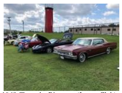
1968 Chevrolet Biscayne (Jaguar Club)