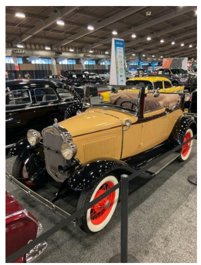
1927 Paige - Mel Burton