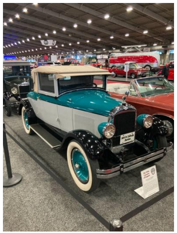
1931 Ford Model A – Chuck Mahan