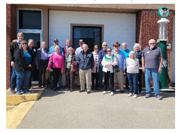
Our tour group to Toys for Big Boys in Chanute, KS