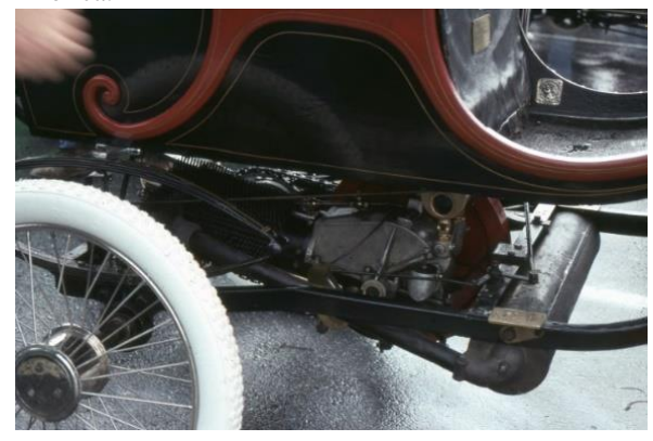
Standard engine placement of the time was beneath the seat