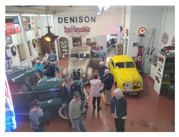
Overlooking one area of Toys for Big Boys