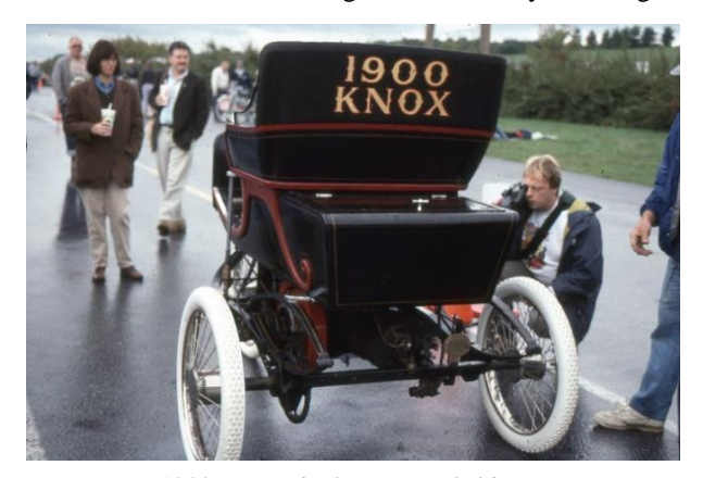
1900 Knox – built in Springfield MA

The car chosen for this month's article caught my eye immediately, first because it is a tricycle and second because of its unusual engine. A tricycle design