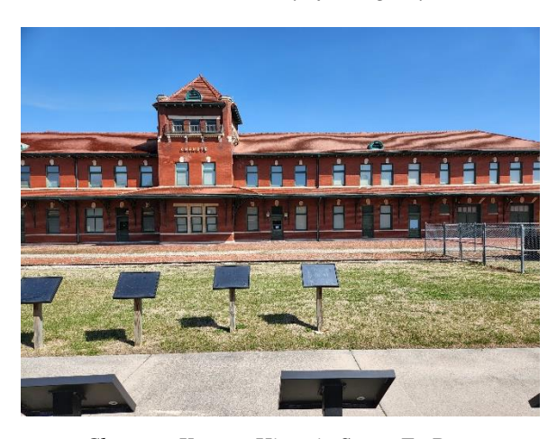
Chanute, Kansas Historic Santa Fe Depot