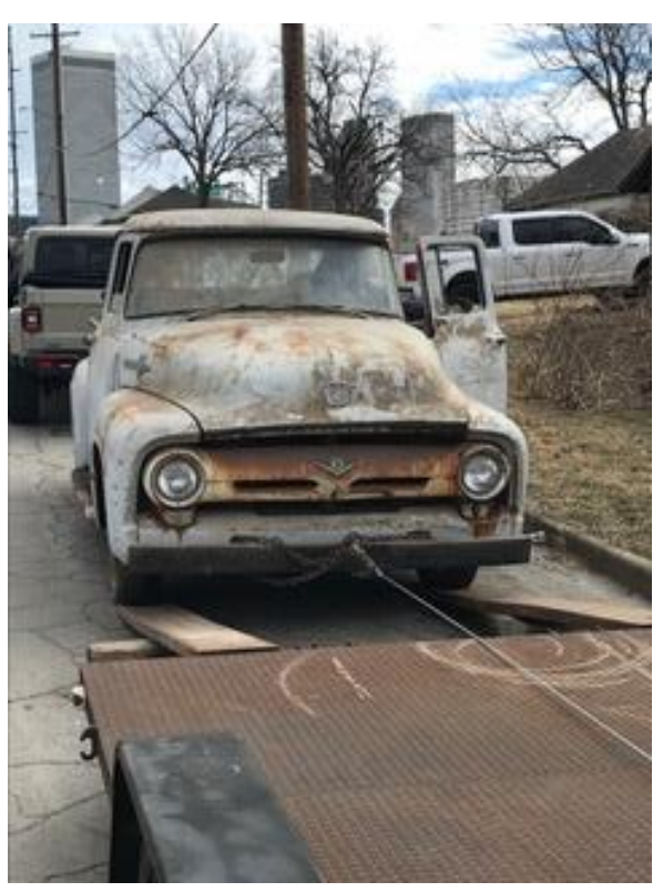
Rescued 1956 Ford Truck

flatbed trailer. The team assembled at the location with power tools, chainsaws, a