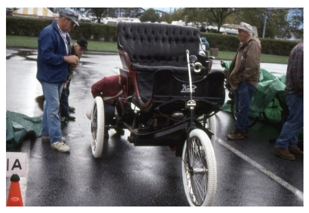
1900 Knox with simple tiller steering and tricycle wheels

dissipation was yet to be settled. Fins of all shapes and sizes were commonly used to draw the heat from the cylinder and dissipate it into the airflow. The designers of the Knox chose a little different approach and selected what looks like very large nails protruding from the single cylinder on all possible external surfaces. Whether they worked better than other arrangements seem iffy to me. With all its spines protruding from the engine, it quickly gained the nickname of "Porcupine Engine".