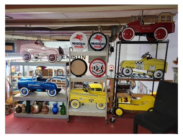
Peddle cars at Toys for Big Boys