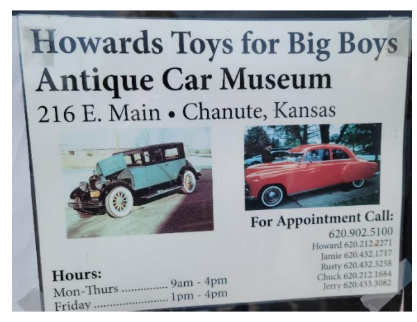
Howard's Toys for Big Boys Antique Car