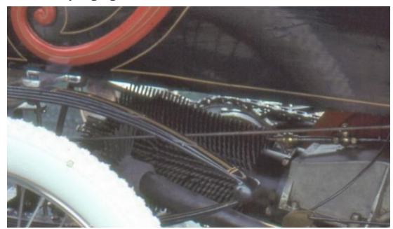
The Porcupine Engine

Successful gasoline engines were still in their infancy. Since most contained only a single cylinder, such as this Knox or in some cases two, air cooling proved to be immensely popular. However, the issue of heat