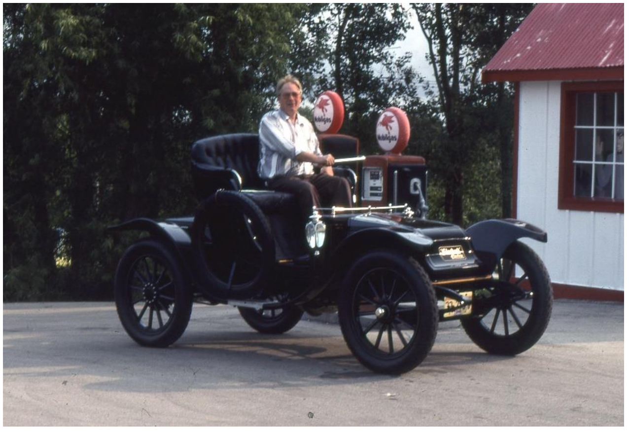
1912 Standard Electric with tiller steering.

The Standard Electric was built in Jackson, Michigan from 1911 to 1915. They claimed to get 110 miles on a charge. Most were the typical coupe body style but a smaller number of runabouts were also sold. I have photographed this car at several shows with the service station shot being in Waukesha, Wisconsin. I am intrigued by the tiller steering for a 1912 automobile as most automakers had long before abandoned the tiller for the steering wheel.