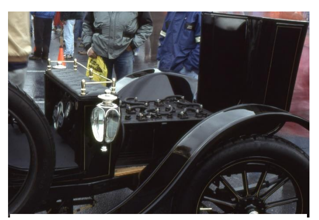
1912 Standard Electric front battery pack.

I'm not sure why the small bench seat exists in front of the driver!