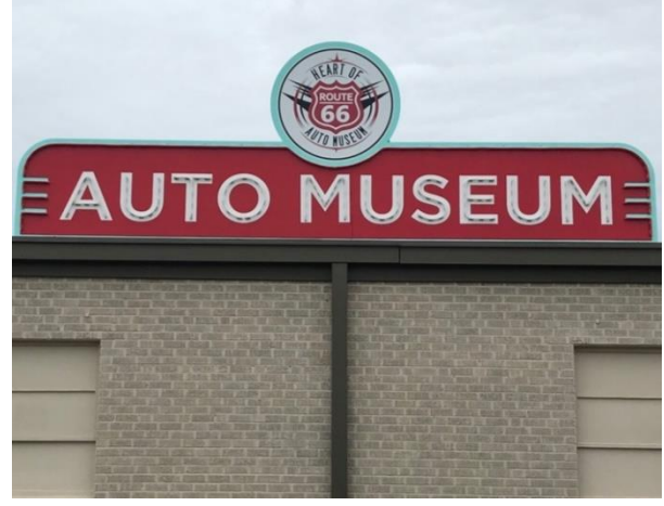
New sign at the Museum

A new sign was added to the side of the museum that faces Route 66. It simply says "AUTO MUSEUM" and is large enough to be easily seen from the road. The neon letters are bright, bold and project amazingly well at night. We're hoping to entice some drive by traffic as it passes the Museum from the Mother Road.