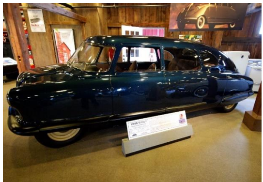
1946 Stout Scarab Experimental - Gilmore Car Museum

The Scarab innovations came at a high cost $5,000 per car, when the luxurious and modern <u>Chrysler Imperial Airflow</u> cost just $1,345. The body was later changed back to steel to reduce costs. There were approximately nine