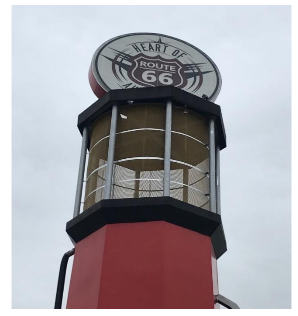
Gas Pump at the Museum with the faux glass cylinder installed.

At The Heart of Route 66 Museum, change was evident while activities and projects continued to move forward. The "world's largest gas pump" received additional attention in 2021. Steel workers finished the installation of the upper faux glass cylinder with a metal wrap around. The steel is tinted with a straw color to simulate fuel in the cylinder ready for delivery. An internal light illuminates the globe when darkness prevails.