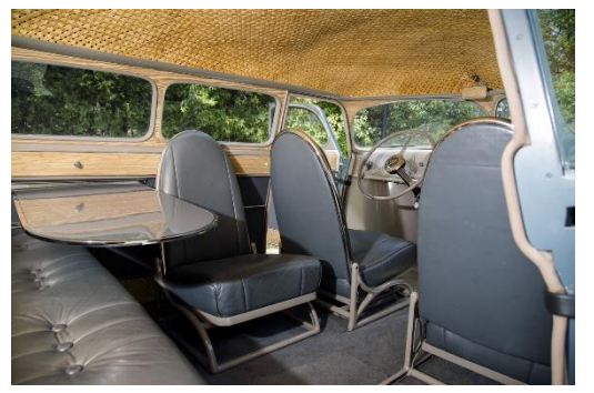
Stout Scarab interior

Stout created a futuristic car design that has been dubbed the first "minivan". The <u>Stout</u> <u>Scarab</u> was a concept car with many innovative