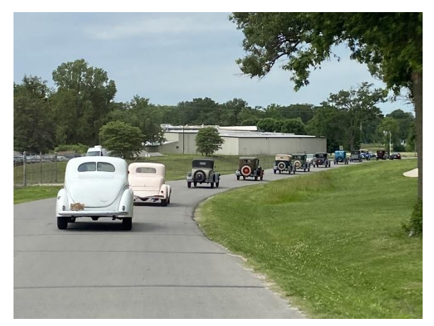
Line of cars driving in the parade.