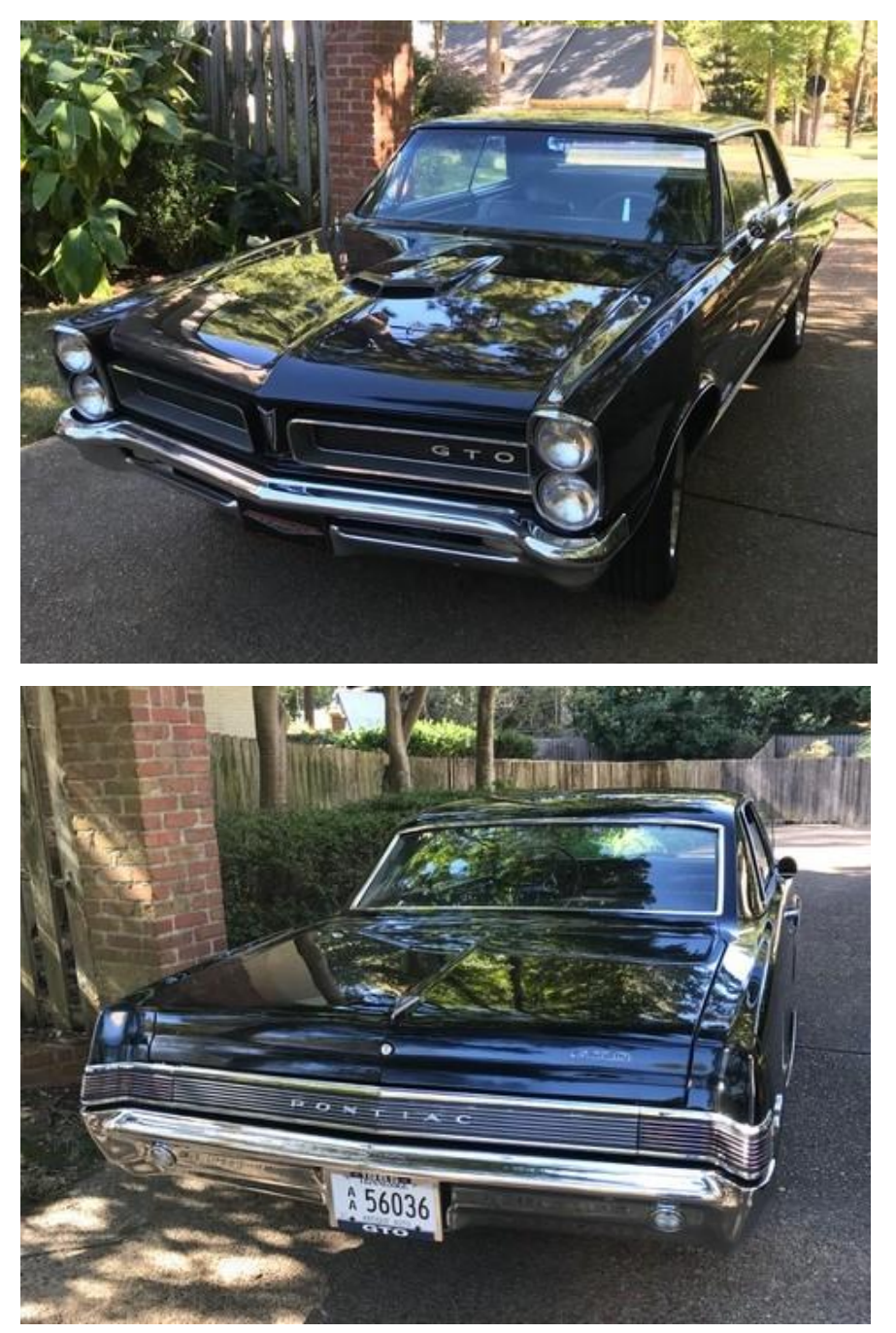
1965 Pontiac GTO owned by Tom and Liga McGahan Complete story on page 2