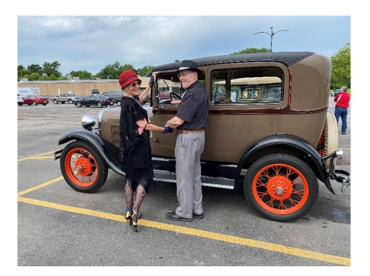
Couple from Springfield, Missouri that dressed in period clothing posing with their Model A Ford.

I enjoyed reading some of the tags on either the front or back of different cars. Some read, "Ronstoy", "Poky", "Hobby 1", "OLDFORD". One couple dressed in period clothing for their car which was fun. Ladies, check out her stockings in the picture.