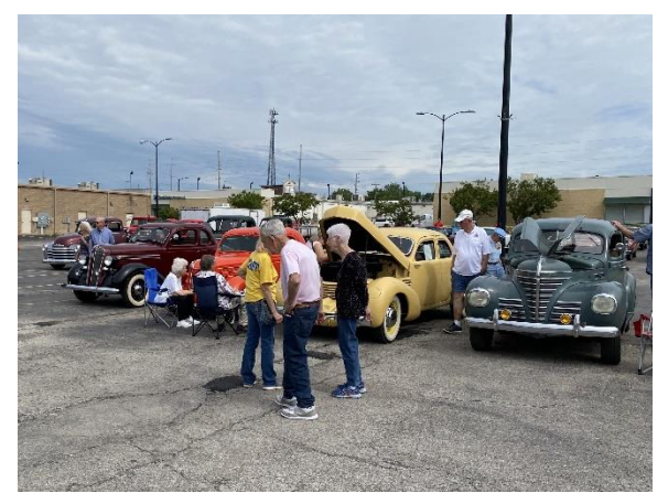
Turner's 1936 Plymouth and Smith's 1937 Cord.