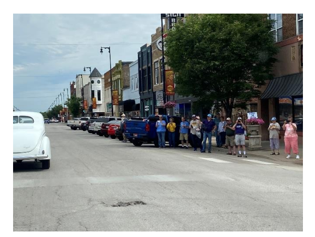
Crowds watching the parade of cars.