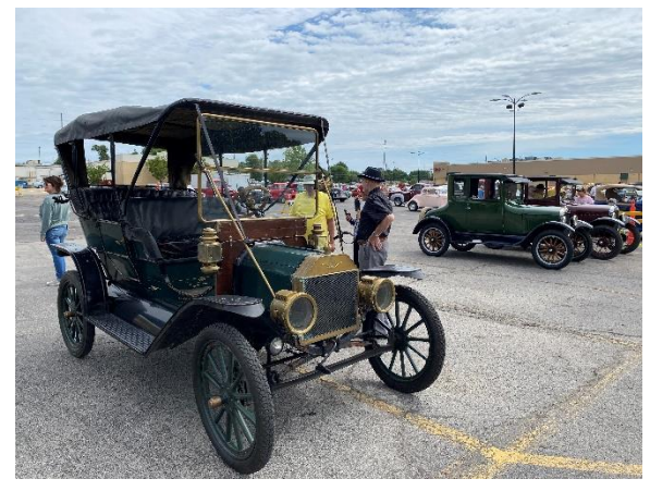
A 1910 Ford Model T was the oldest car participating.