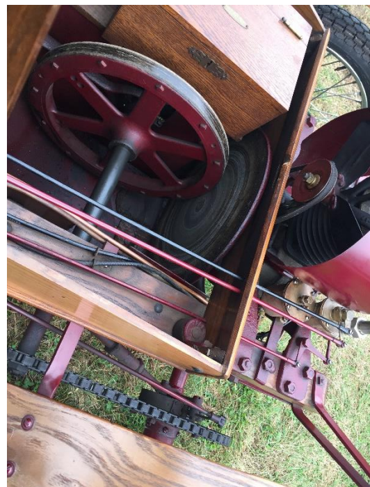
1906 Orient friction drive system

The friction drive system shown at the right can be thought of as an infinitely variable transmission, but the idea soon fell out of favor within the fledgling automobile industry. I presume it was push started as I see no means of cranking it! Orient was produced by the Waltham Manufacturing Company in Waltham, Mass from 1900 to 1907.