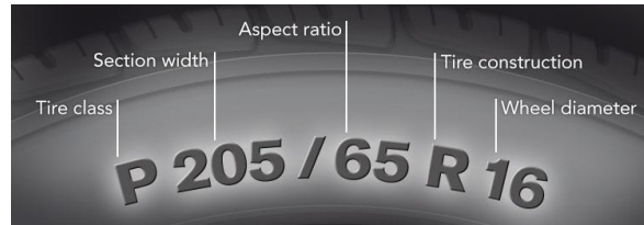
Sidewall Tire code

If the tire class is “P” or blank means the tire is a standard load rating (4 ply) tire. “P” stands for P-metric rating for US passenger cars. Blank (no “P”)