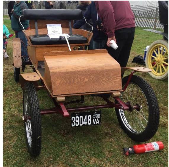
1906 Orient Buckboard

The engine shown in the next view developed all of 4 horsepower!