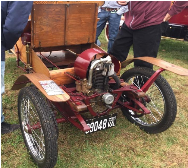
1906 Orient engine

The friction drive system shown at the right can be thought of as an infinitely variable transmission, but the idea soon fell out of favor within the fledgling automobile industry. I presume it was push started as I see no means of cranking it! Orient was produced by the Waltham Manufacturing Company in Waltham, Mass from 1900 to 1907.