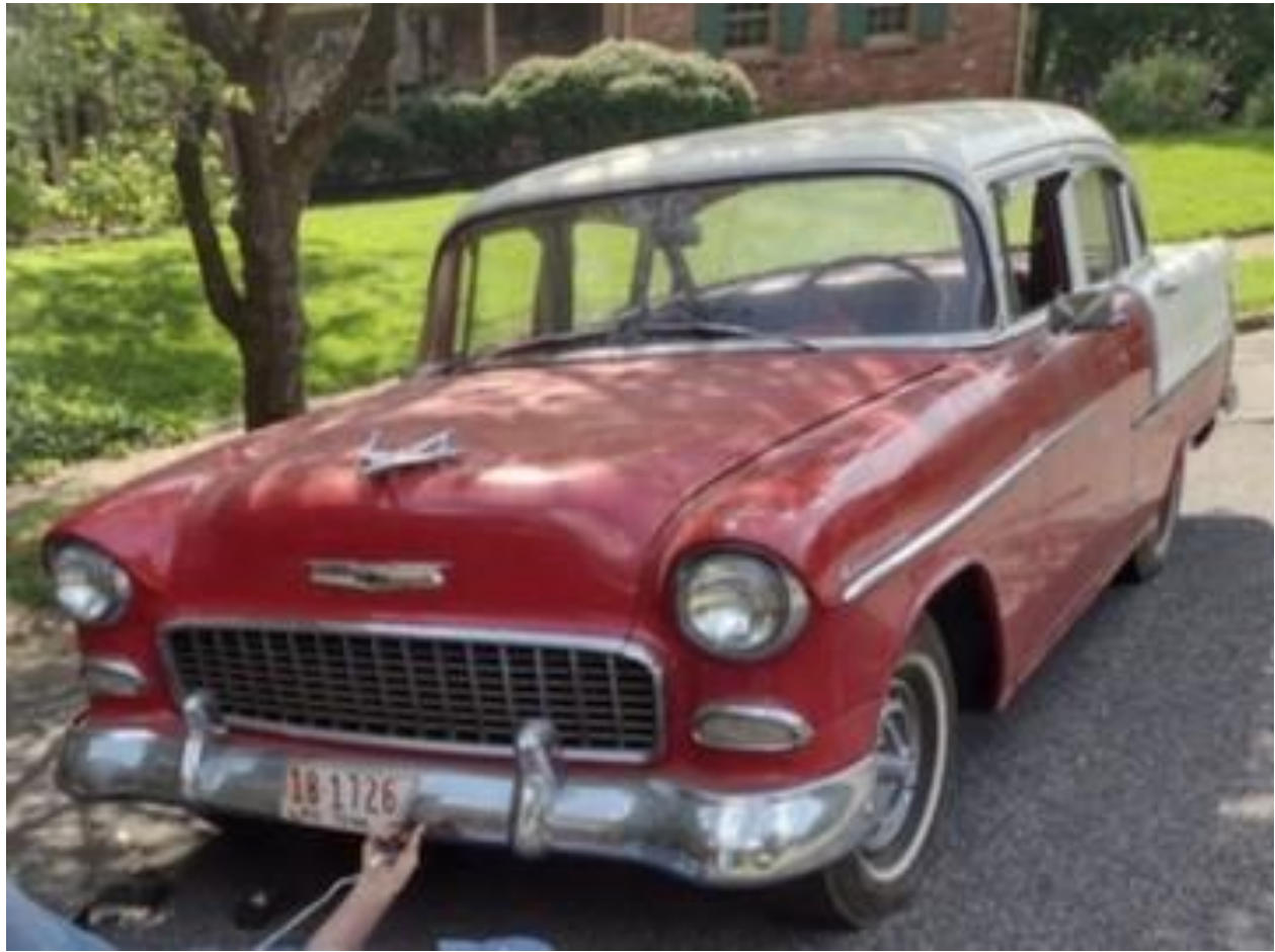
1955 Chevy owned by Tom and Liga McGahan Complete story on page 2