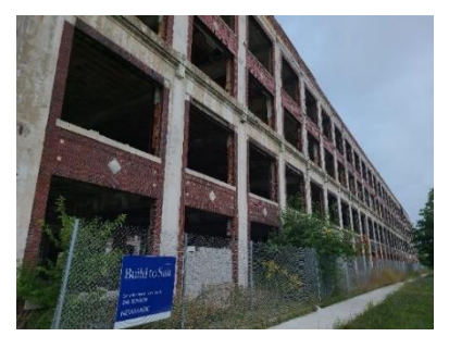
"Build to Suit" attempt to attract new businesses to historic Packard Plant site.

Since then, although portions of the plant have been converted to other purposes, the preponderance of the buildings have stood abandoned. Efforts at full-scale repurposing by the City of Detroit and several private investors have proven largely unsuccessful.