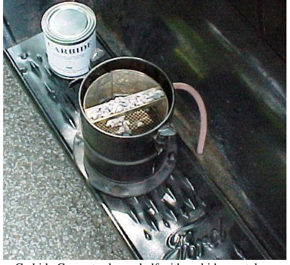
Carbide Generator lower half with carbide crystals.

All Carbide headlights and miner lamps work on the same principle. The "generator" is a two-part container that holds water in the top