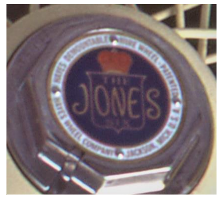
Hayes Wire Wheel

Production began in 1914 with the car being successful and attracting financing from eastern bankers. I understand both trucks and passenger cars were produced though I have never seen an