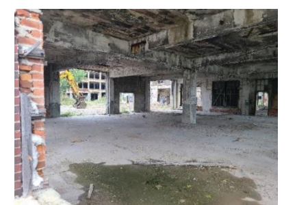
Interior of west end of plant. The narrow building width made it difficult to modernize for new automated assembly line machinery.