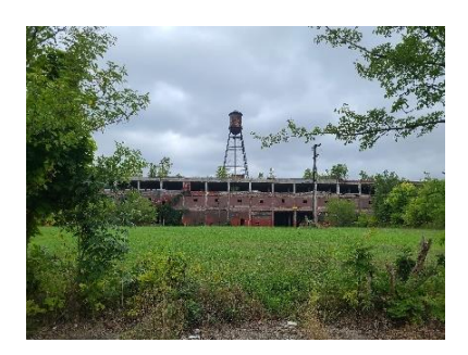
Urban decay and razing of east side of factory.