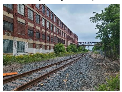
Packard plant along Colcord Avenue.