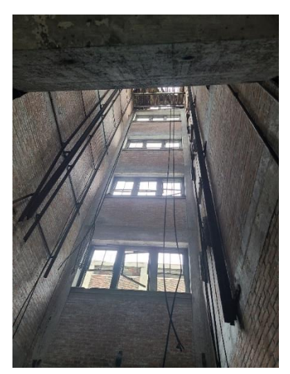
6-story elevator shaft for moving industrial materials and automobiles between floors of Packard plant.