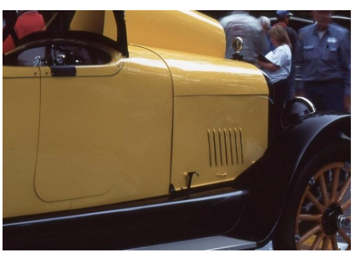
Note the small hood louvers.

As a sidebar comment, I understand Clyde Cessna built his first airplane in a corner of the factory!