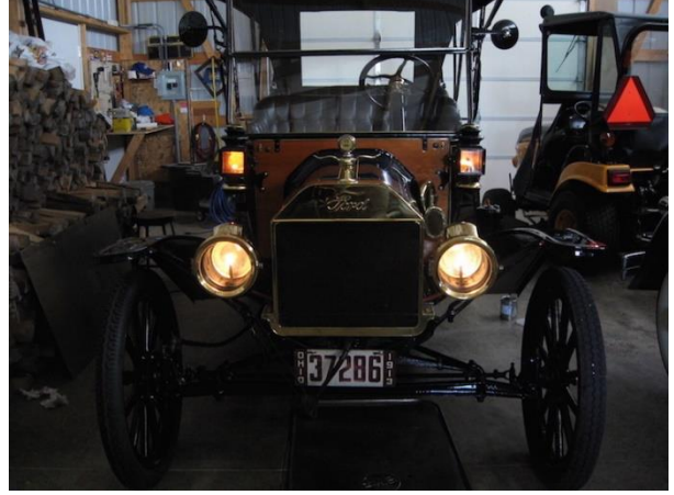
1913 Ford Model T carbide headlamps and kerosene side lamps

Carbide headlights use acetylene gas as the fuel source. <u>Carbide lamps</u> are powered by the reaction of calcium carbide (CaC<sub>2</sub>) with water (H<sub>2</sub>O). The reaction creates acetylene gas (C<sub>2</sub>H<sub>2</sub>). Acetylene gas burns with a clean white