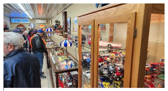
Chief Eaton's antique toy car collection.