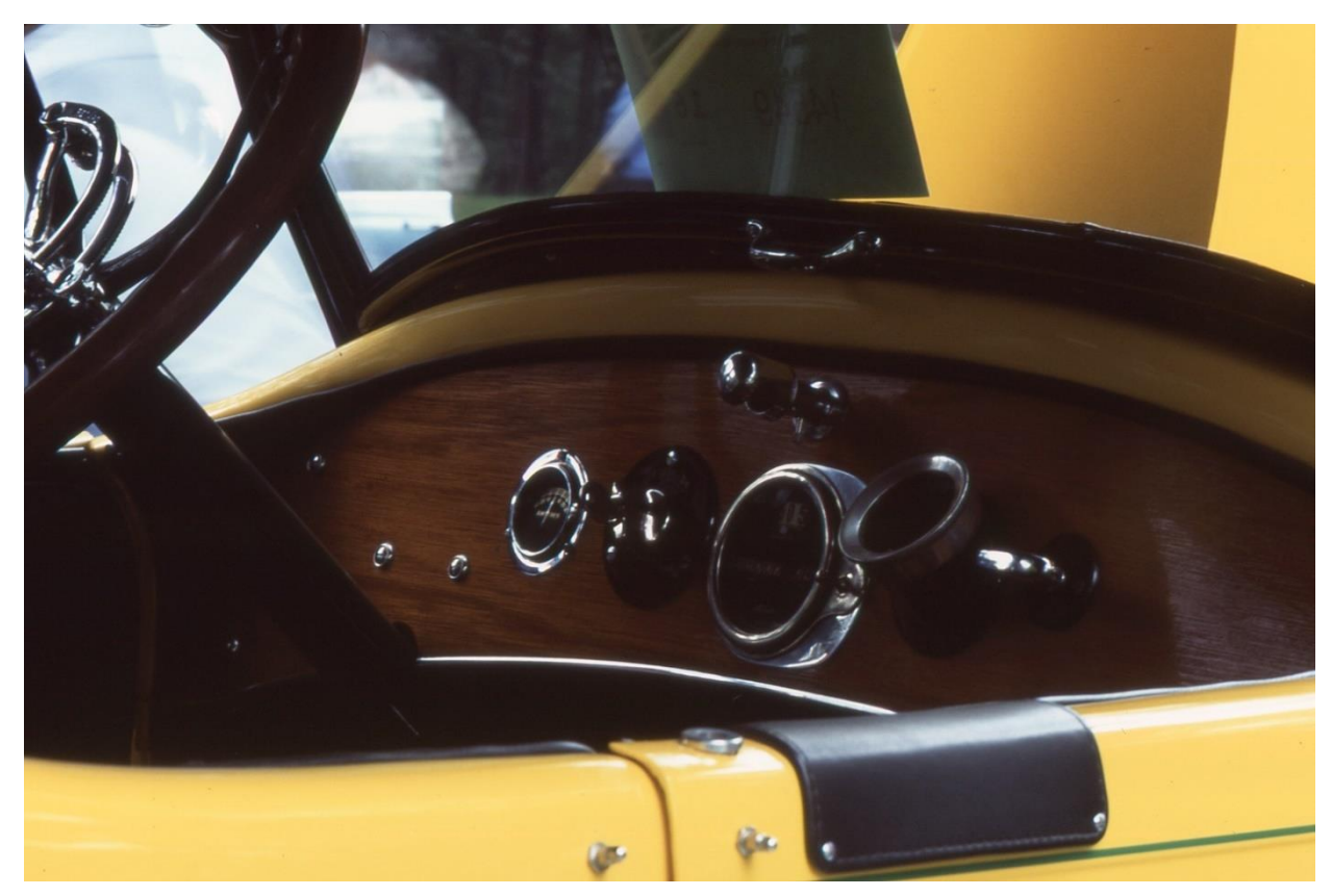
Clean and simple Jones Six dash.

The Sedgwick County Museum in downtown Wichita displays a 1918 Jones Six in a Smithsonian worthy exhibit. It is worth a trip to the museum!