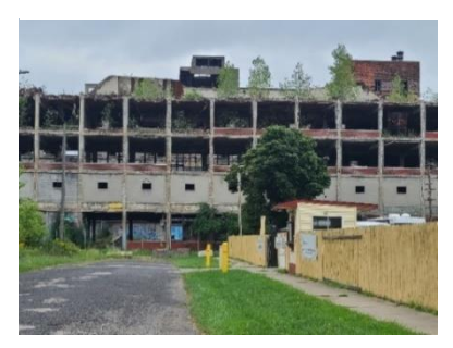
Factory after years of neglect.