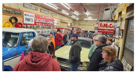
Chief Eaton's auto collection.