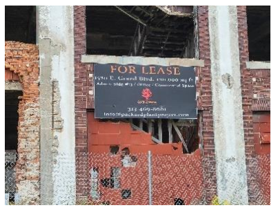
"For Lease" attempts to repurpose Packard Plant buildings.