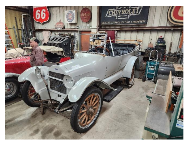
Rebuilt 1918 Chevrolet.