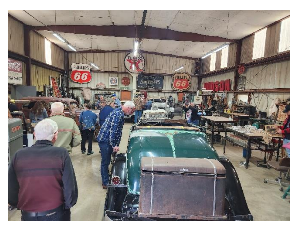
Visiting Wheels of the Past shop.