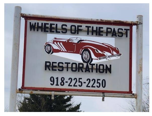
Wheels of the Past, 2320 Agra Rd, Cushing, OK.