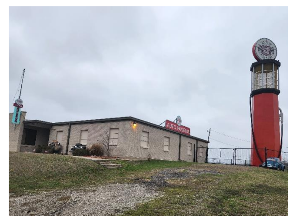
Met at Heart of Route 66 Auto Museum to caravan to Wheels of the Past.