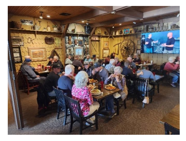
Lunch at Steer Inn, Cushing, OK following tour.