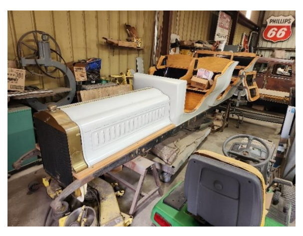
Rebuilt wood body for a Thomas automobile.