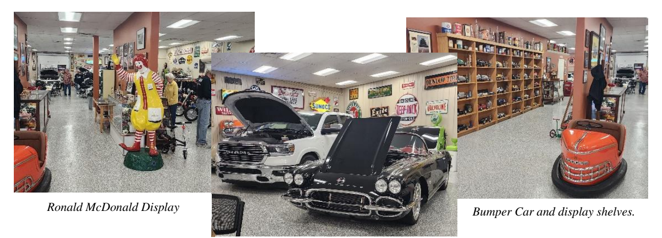
Corvette and Ram Truck