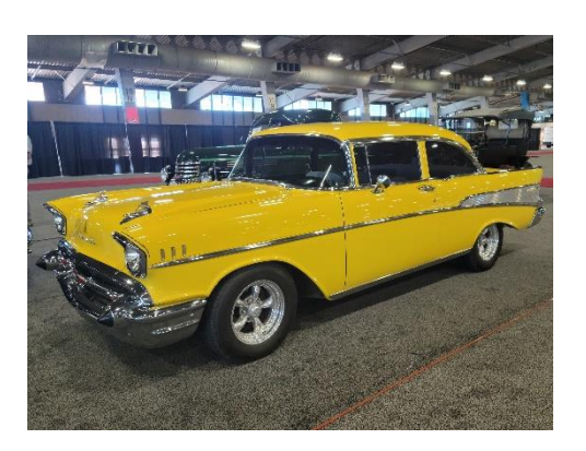
1957 Chevrolet - Clyde & Debbie Harding