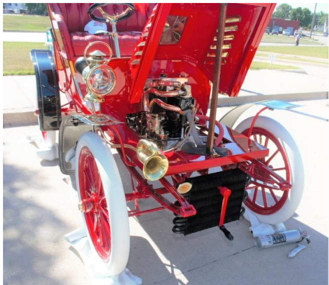
Notice how low the radiator is mounted!