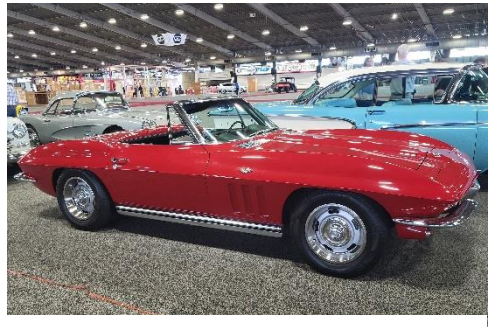
1965 Corvette – Elbert Polk