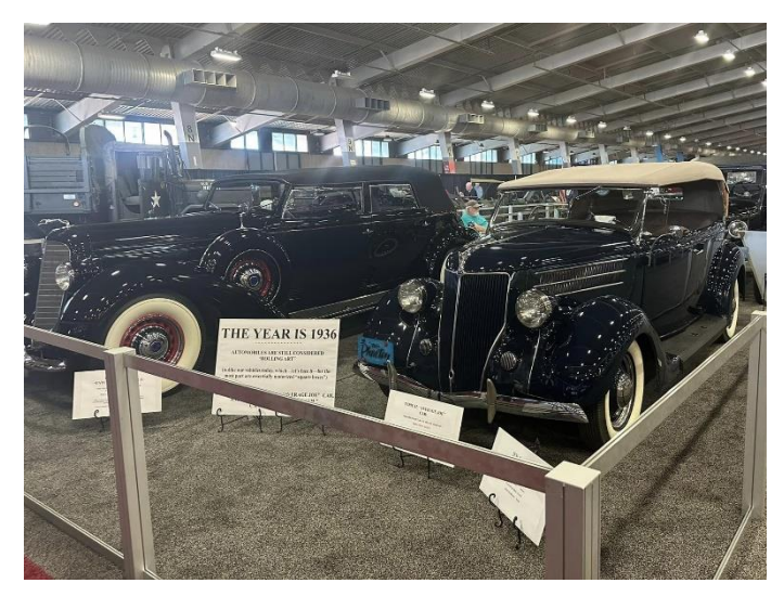
Display by Steve Schnitzer contrasting a 1936 Ford vs a 1936 Lincoln.