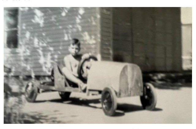
Turnercar Version 2 - David driving

I think I was about five or six when my father decided to build my brother and me a small car to drive around the block on the sidewalk. It was a simple car at first with a 2" x 2" wooden frame, a plywood seat and a simple barrel shaped hood covered with a sheet of aluminum. It did have kingpins and a tie rod for a steering mechanism with a simple shaft for a steering column with a wheel and tire off a training bicycle for a steering wheel. Window sash cord was wrapped around the column and the ends fastened to the tie rod for steering. This arrangement worked quite well for the nearly nine-year life of the car.