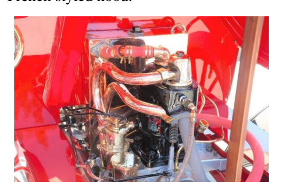
The Holley one-cylinder engine

The car has a 5hp water cooled single cylinder engine mounted in the front under a French styled hood.