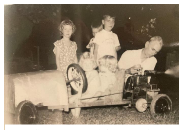
All my cousins & my dad making smoke

Power was always transmitted from the engine to a jackshaft and from the jackshaft to both rear wheels with pulleys and v-belts. The belt from the engine to the jackshaft utilized a tensioner pulley connected to a foot pedal that became the de facto clutch.