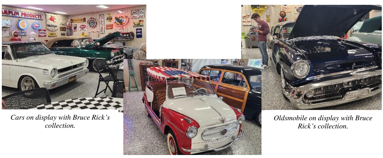
1960 Fiat Jolly