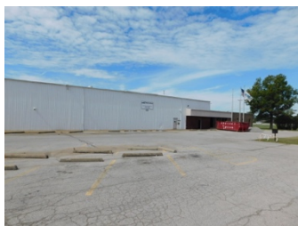
Cord production facility, 9620 E Broken Arrow Expressway