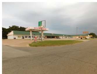
Former S.A.M.C.O. production facility in Mannford, OK