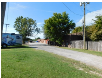
Pickle Factory in Broken Arrow, OK